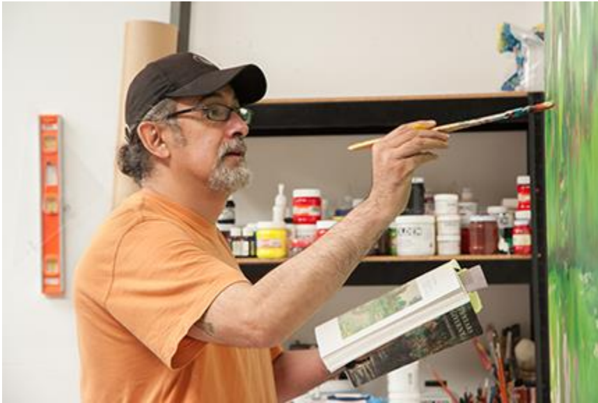
Enrique Chagoya at work in his studio, 2009.